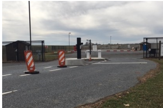
This facility was funded using a PA DEP Act 101, Section 902 Recycling Grant

Warwick Township's Leaf and Woody Yard Waste Drop-off Site is located at 550 Stauffer Road , between East Woods Drive & East Millport Road, north of Lancaster Airport. The site accepts tree limbs (not larger than 8" diameter), shrubs, leaves & garden residue . Signs are posted directing motorists to the appropriate drop-off area for these materials. Grass is NOT accepted at the site . The site is available seven days per week from dawn to dusk. This site is accessed via a key fob that is available to Warwick Township residents for a nominal fee (no commercial use of any kind). Please contact the Administration office at 717-626-8900 or visit our website at www.warwicktownship.org for more information.