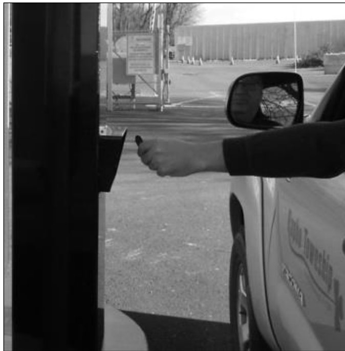
The picture above illustrates how the key fob would be used at the Facility.

Our goal is to make these changes at a minimal inconvenience to our residents. The changes are necessary to insure the long term viability of the facility and to have capacity for our residents. Thank you for your cooperation in this matter.